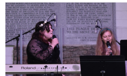
Bella singing with a friend at the talent show