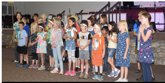
The Wolf Cubs & Benjamites singing and dancing to the song Yeshua