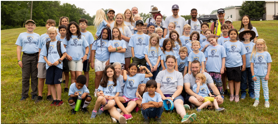
Wolf Cubs and Benjamites, Ages 6-12, Camp Mashiach 2023

We had another great year of camp. I want to thank all of the Adult Staff for making it great. I know most of you had not been to camp before and where not sure what to expect. Like I said before we left for camp – you think you are going to camp to minister to the kids – but they will minister to you. Was I right? I know I was in tears quite a few times.